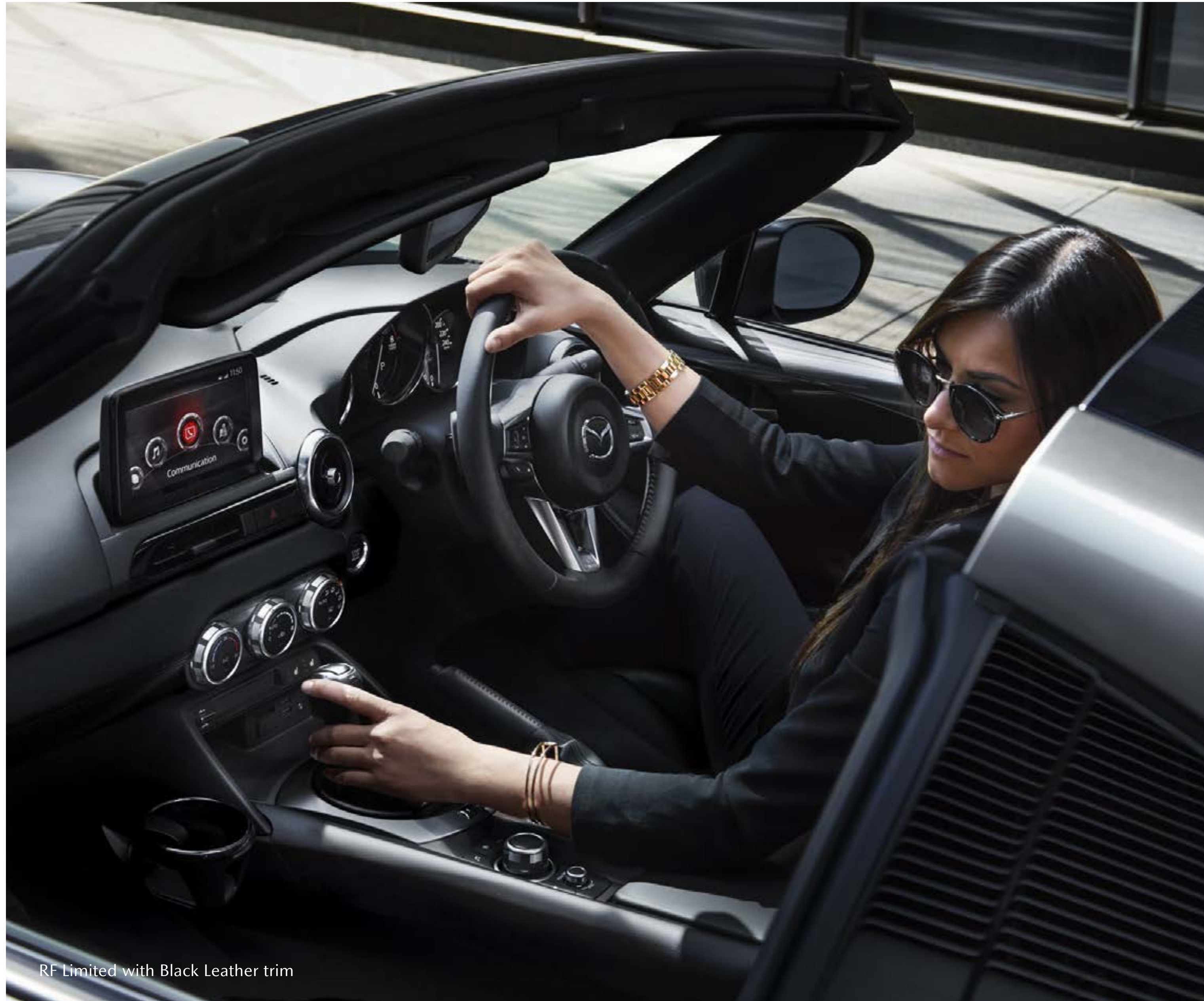
RF Limited with Black Leather trim