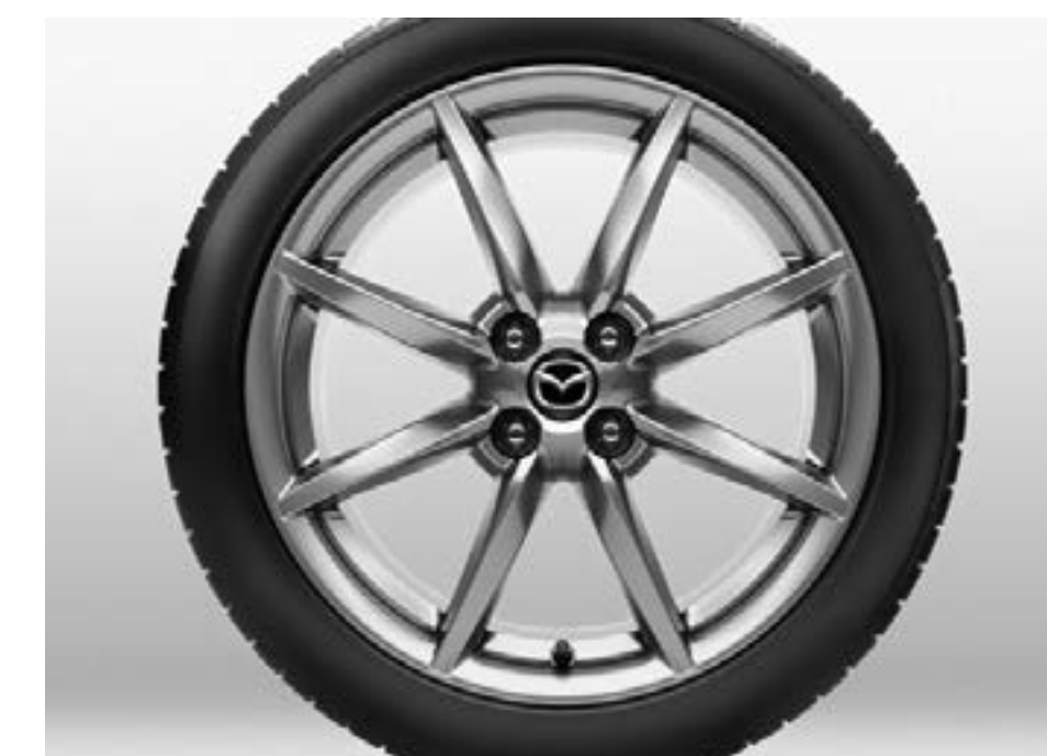
17-inch Bright Silver Alloy Wheel (RF Limited)