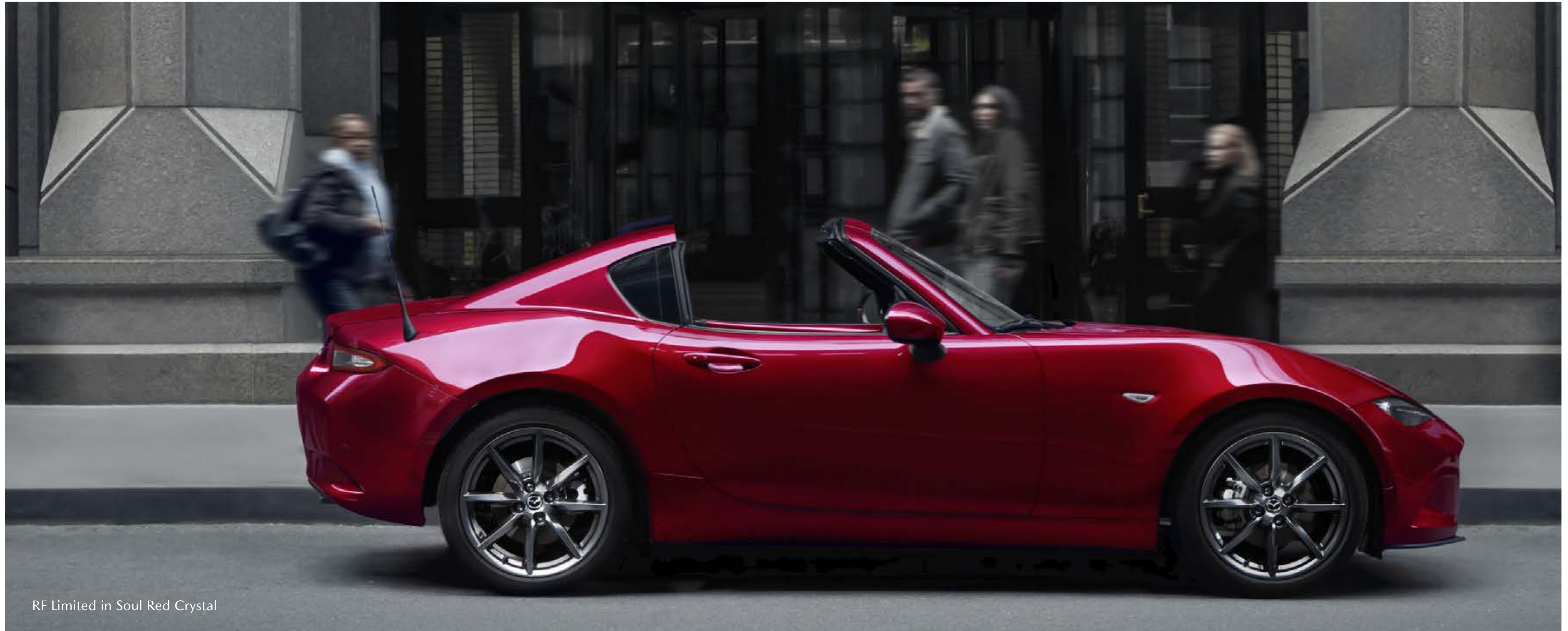
RF Limited in Soul Red Crystal