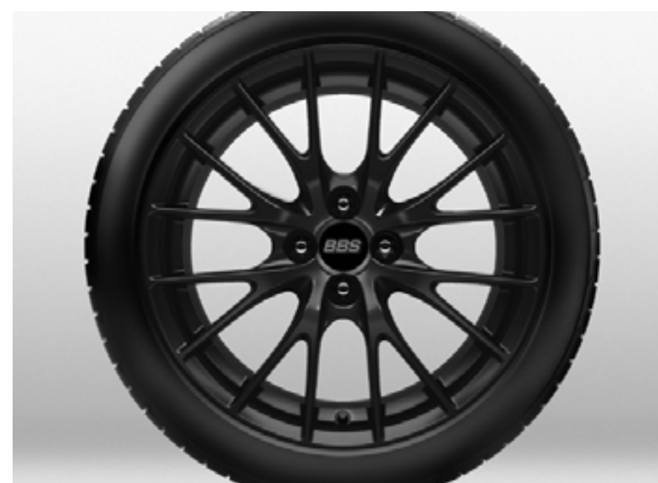
17-inch BBS Gunmetal Forged Alloy Wheel (RF GT)